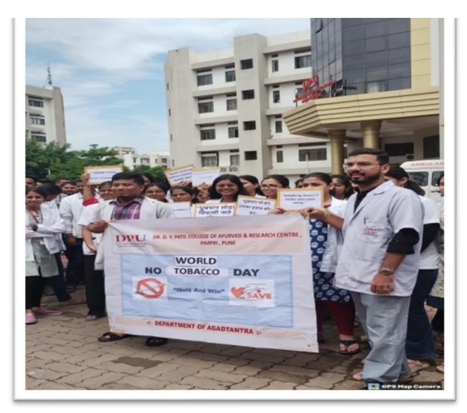
Fig. World No Tobacco Day celebration by students of NSS for sustainable environment