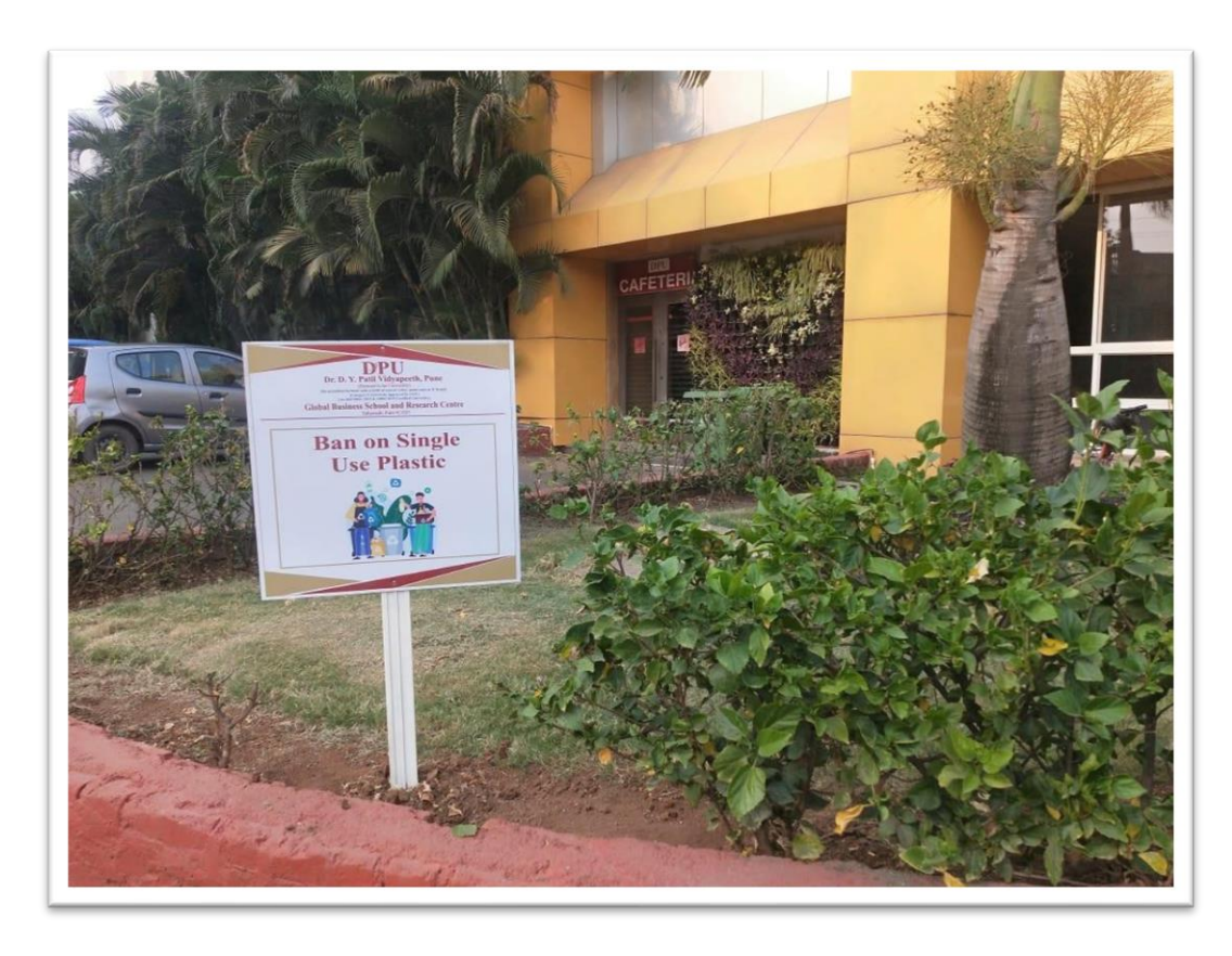
Fig: Signage Board for Ban on Single Use Plastic within campus for a sustainable and healthy environment