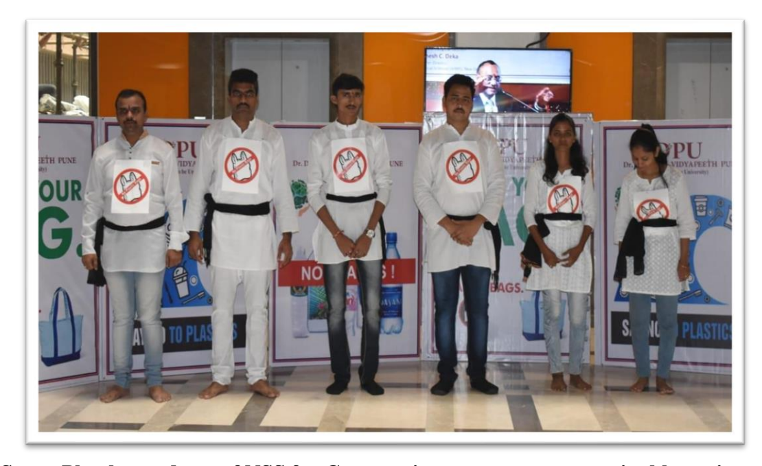
Fig. Street Play by students of NSS for Community awareness on sustainable environment