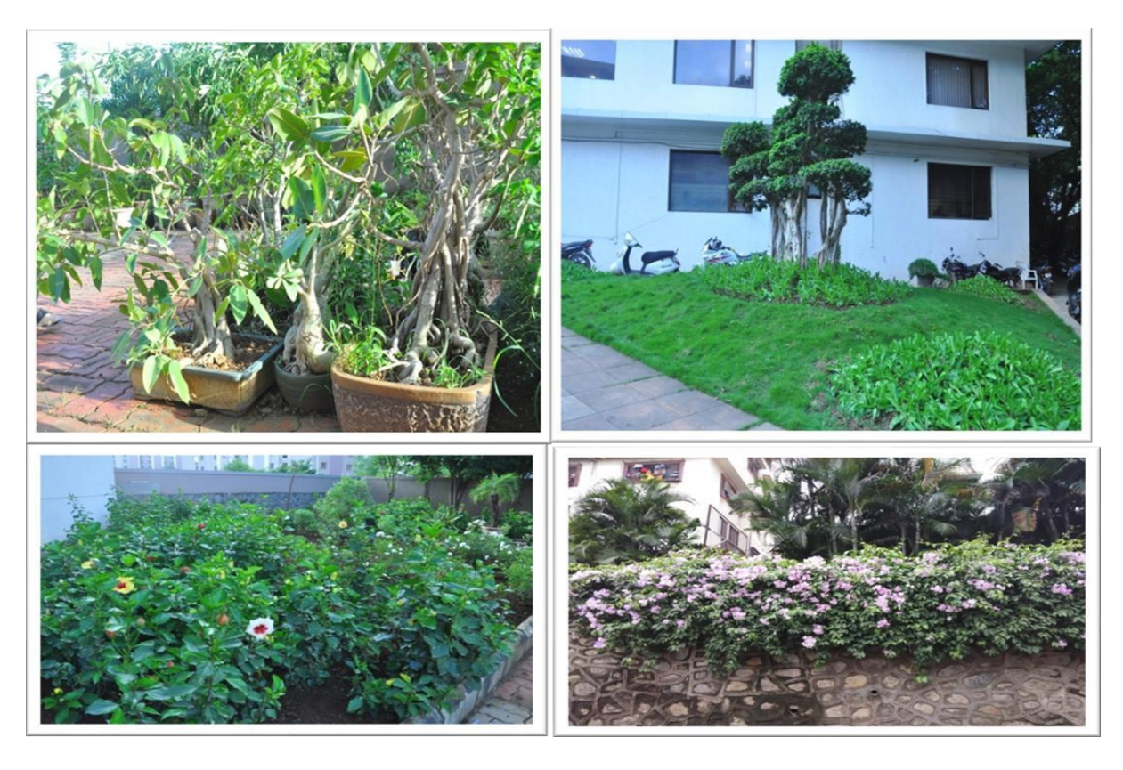
Fig: The university maintains sustainable learning environment by planting trees and creating green campus by students of NSS

As per the Clean and Green Policy, the Vidyapeeth strives to plant various types of ornamental and medicinal varieties, and wild plant species of trees in large numbers within and outside the campus. Gardeners and full-time adequate support staff have been appointed for the maintenance of gardens and keeping the campus litter-free, clean and Green Campus. The campus includes an Herbal Garden, which is also used to teach the students from the College of Ayurveda about the various types of medicinal plants. The tree-plantation drives are undertaken by the NSS and NCC Units of the college and by the Departments of Community Medicine and Community Dentistry on a regular basis.