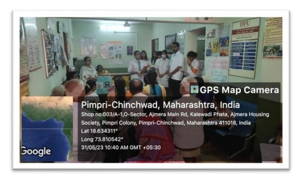
Fig. Awareness Program on Health Hazards Related To Tobacco Consumption by students of NSS for sustainable environment