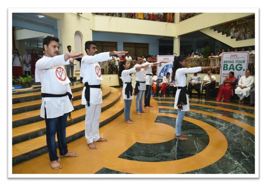
Fig. No Plastic Oath by students of NSS for sustainable environment