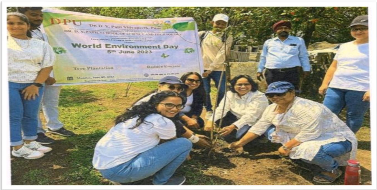
Fig. Celebration of World Environment Day by students of NSS for sustainable environment

Raising awareness about the importance of biodiversity, land conservation, and sustainable land use through educational programs and public campaigns mobilizes support for SDG 1