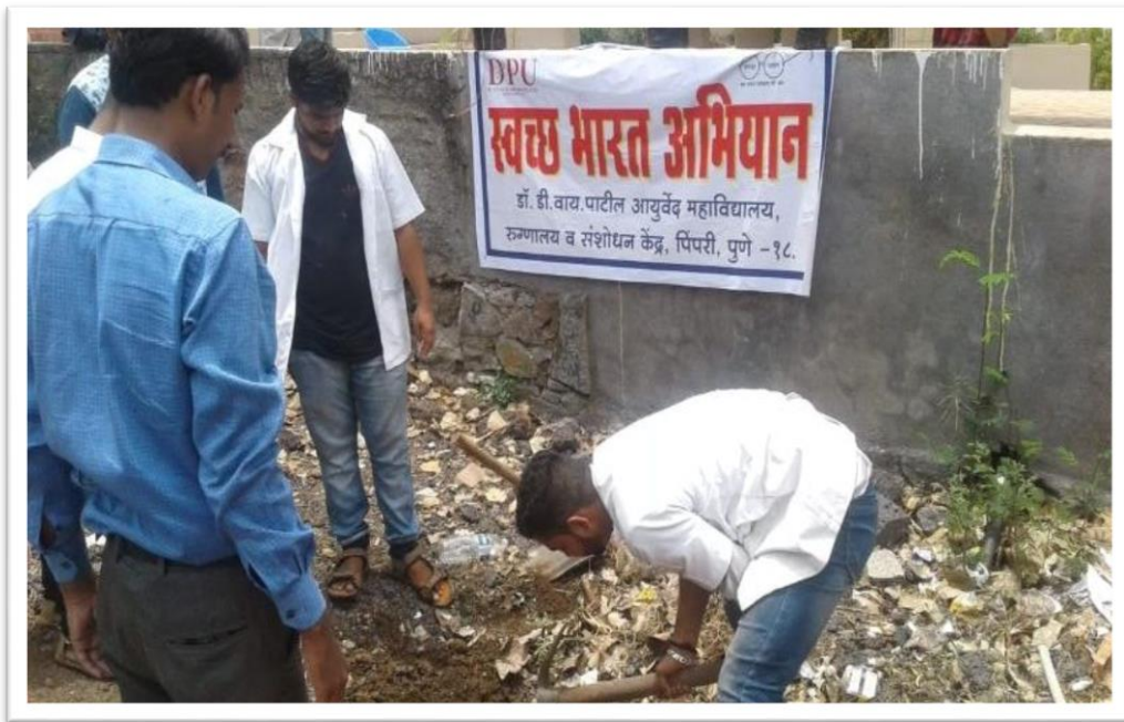
Fig. Swachhta Bharat Abhiyan by students of NSS for sustainable environment

Dr. D. Y. Patil Vidyapeeth (DPU), Pimpri, Pune organized Cleanliness Drive under Swachh Bharat Abhiyaan Program on 24 th June at Durga Tekdi, Nigdi, Pune. Swachh Bharat Abhiyan is a national cleanliness campaign launched by the Indian government in 2014. Its primary goal is to create a clean and hygienic India. The campaign aims to eliminate open defecation, build and maintain toilets, and improve waste management systems. Through community participation, workshops, and awareness programs, Swachta Abhiyaan encourages individuals and communities to adopt sustainable practices that contribute to a healthier environment.