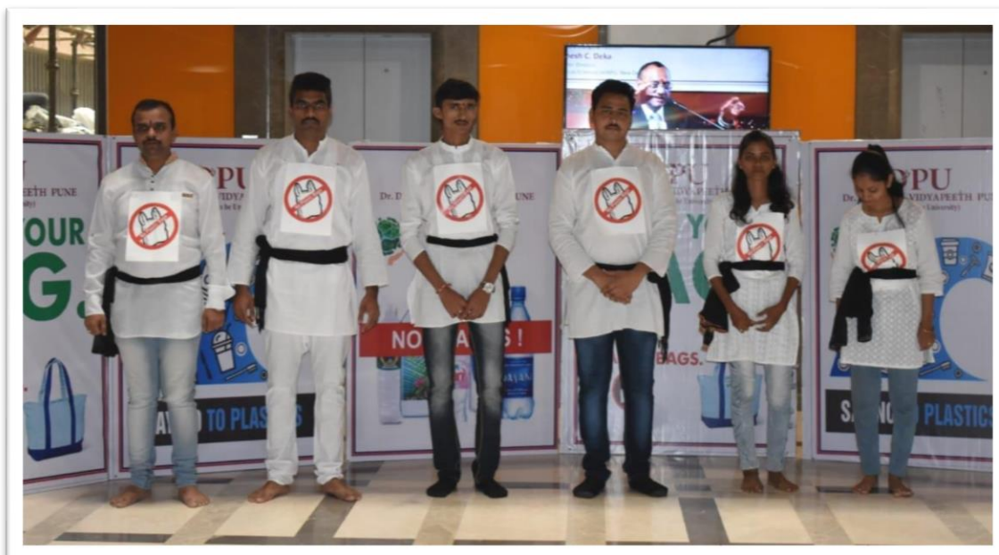
Fig. Street Play for Community awareness on sustainable environment