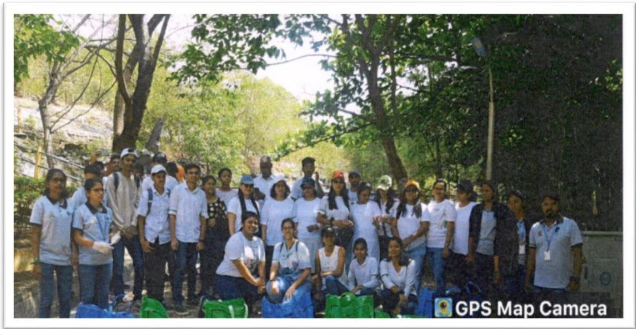
Fig. Tree plantation drives by students of NSS for sustainable environment

Tree planting drives organized by the university further enhance these efforts. By restoring local habitats and improving biodiversity, these initiatives contribute to better water management and climate resilience. Trees play a vital role in preventing soil erosion, maintaining water cycles, and enhancing the overall health of ecosystems, which indirectly supports marine life.