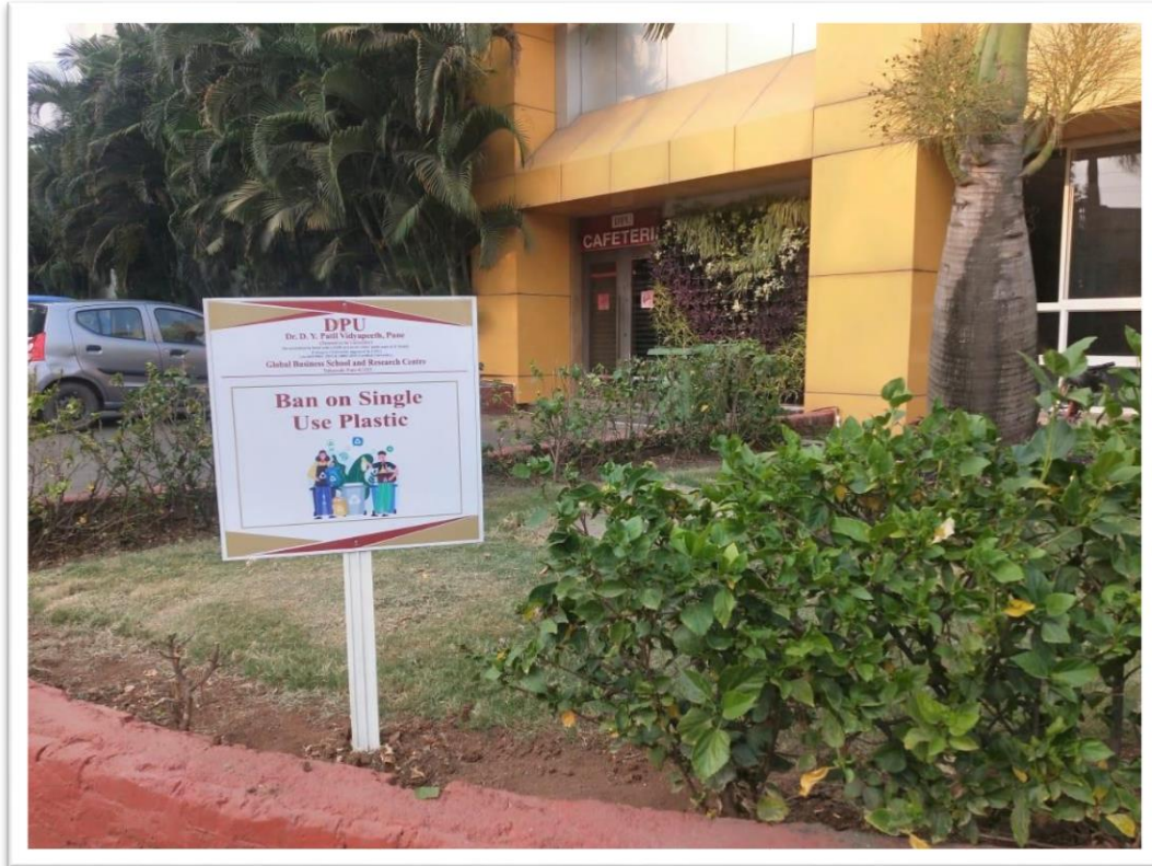
Fig: Signage Board for Ban on Single Use Plastic within campus for a sustainable and healthy environment