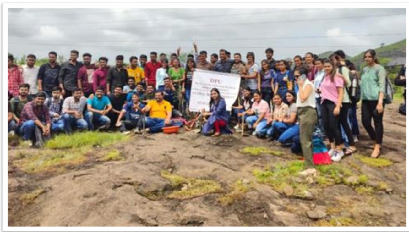
Fig: Participations in Tree Plantations initiatives by students of NSS for sustainable environment