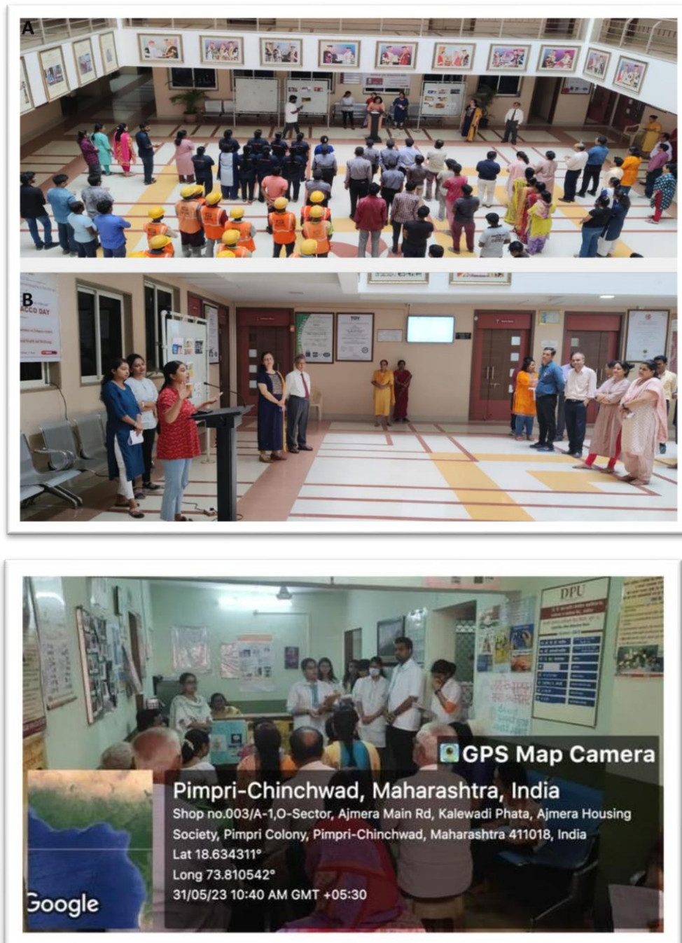
Fig. Awareness Program to spread the message- ' grow food and not tobacco' by students of NSS for sustainable environment

The NSS Unit of Dr. D. Y. Patil Biotechnology & Bioinformatics Institute, organized an awareness program aligning with this year's theme, "Grow Food, Not Tobacco, ". The event aimed to raise awareness about the harmful effects of tobacco consumption on health, the environment, and its impact on food security. Key objectives included discussing the hazards of tobacco cultivation, its environmental impact, and the benefits of quitting tobacco. The program highlighted how tobacco farming affects food production, contributing to hunger and malnutrition.