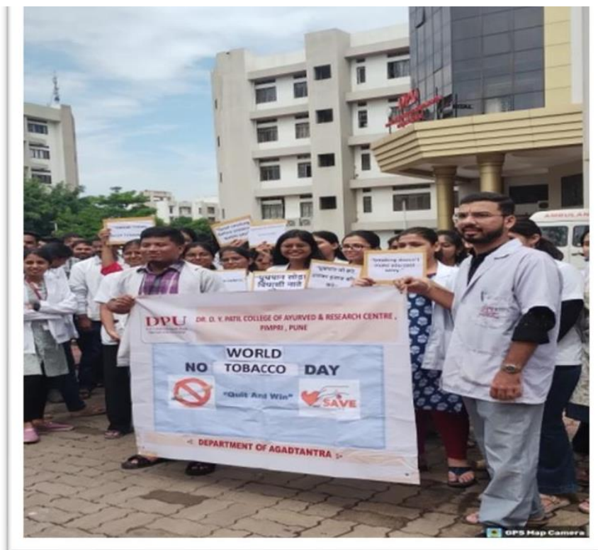
Fig. World No Tobacco Day celebration by students of NSS for sustainable environment

On the occasion of “World No Tobacco Day” an awareness program was organized by Department of Community Medicine. It contained details regarding the history and importance of World No Tobacco Day, tobacco production statistics on a global level, ill effects of tobacco usage, note on various sources of tobacco and preventive measures to be taken against tobacco usage. Awareness Rally was also conducted to educate the public about the hazards of Tobacco chewing.