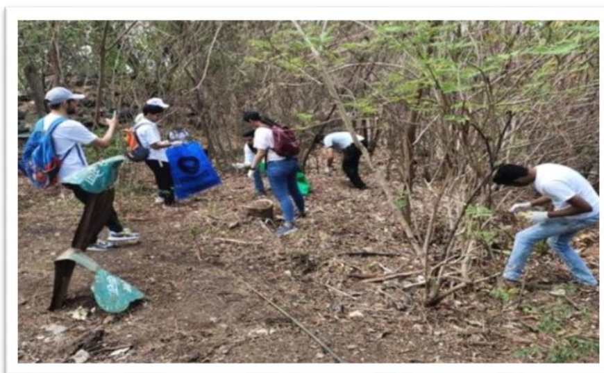
Fig. Cleanliness and plastic free initiatives by students of NSS for sustainable environment.

On World Environment Day the NSS unit in association with IQAC of Dr. D. Y. Patil Homoeopathic Medical College and Research Centre, Pune had organised a 'Cleanliness drive' on 22 nd June 2023 at Village Vadgaon Ghenand, Taluka-Khed, Pune. Total 51 NSS Volunteers participated in the above activity. The volunteers collected the waste from different area of village and disposed of in dustbin. They also collected waste of plastic and contributed to the 'Plastic-free Environment' to save Earth. The volunteers portrayed the message to the residents to keep our surroundings clean and plastic-free. The collected waste was shifted to the college to dispose of to the concerned department of the PCMC.