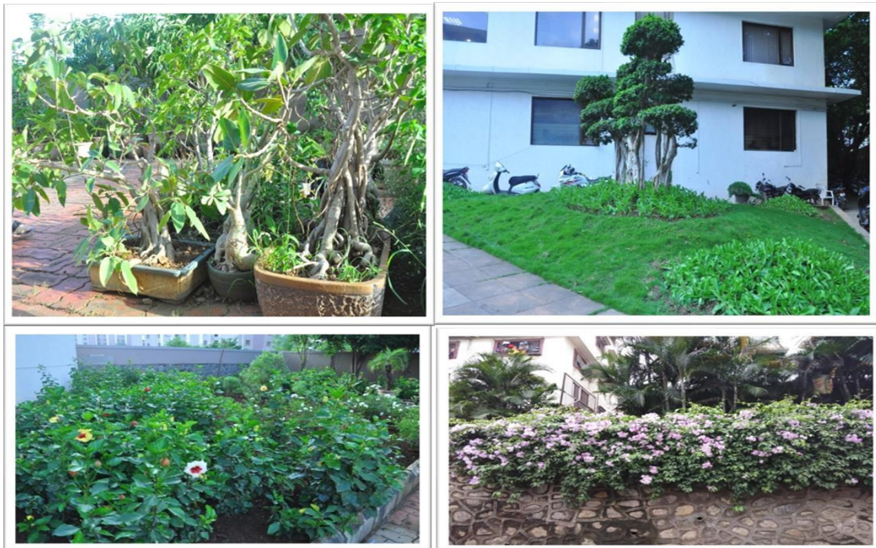
Fig: The university maintains sustainable learning environment with Trees and Plants by creating Green campus by students of NSS