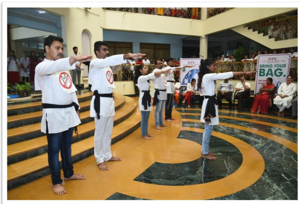
Fig. No Plastic Oath for sustainable environment