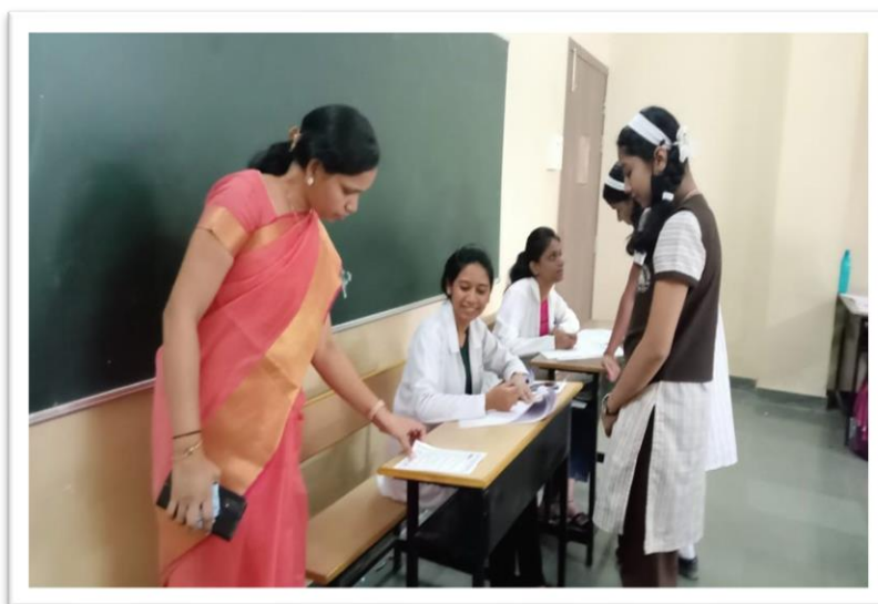
Menstrual Health Campaign and Menstrual Health awareness programme

As a part of Community outreach program, on March 8, 2024, in celebration of International Women's Day, Dr. D.Y. Patil College of Ayurved & Research Centre organized a menstrual health campaign aimed at educating and empowering teenage girls. The event successfully reached a total of 120 girls. This initiative highlights the importance of menstrual health education and aims to break the stigma surrounding menstruation. The campaign included informative sessions that covered various aspects of menstrual health, hygiene practices, and the biological processes involved. The goal was to provide young girls with the knowledge and resources they need to manage their menstrual health confidently and effectively.