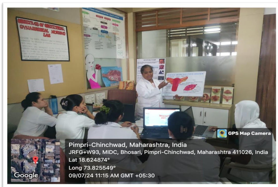
Gynecology health check-up to students along with care of reproductive health