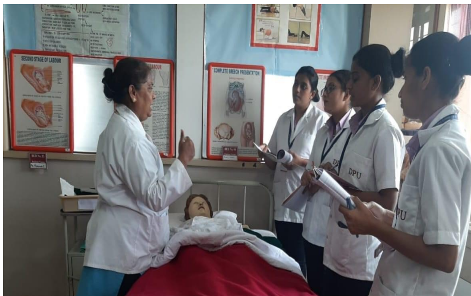
Reproductive health awareness on PCOD on 9 th July 2024