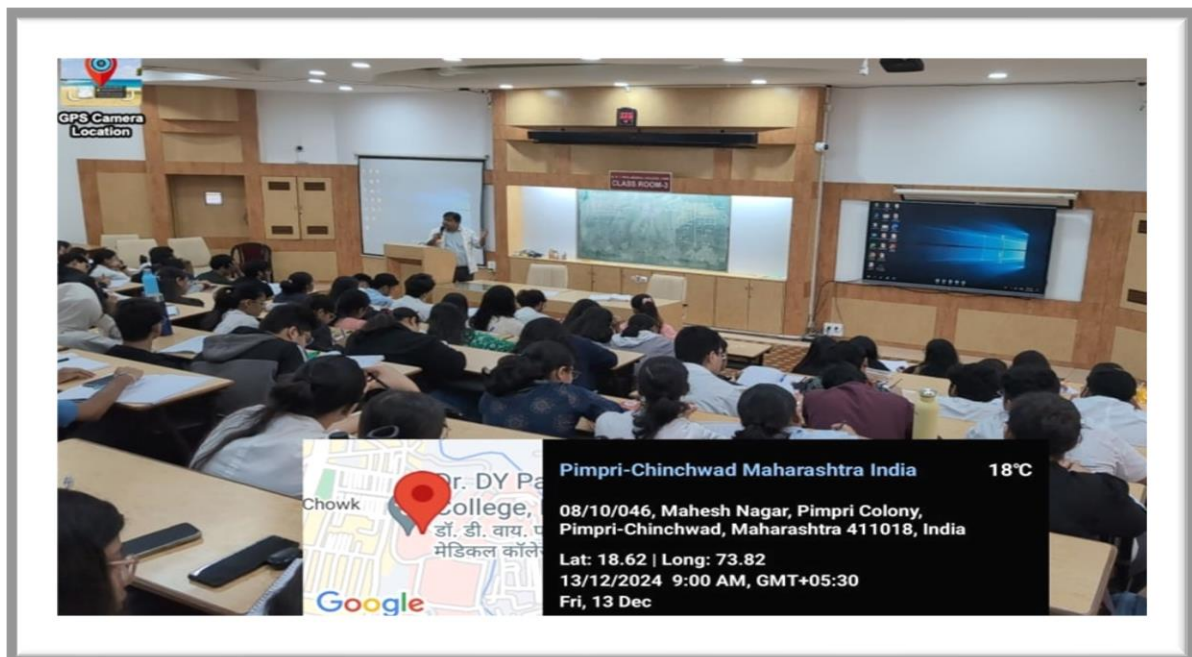
White Coat Ceremony on December 19, 2024