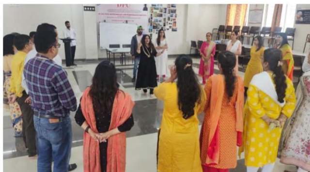
Team building and Stress Management Session As a Staff Welfare Activity of Dr. D. Y. Patil Biotechnology and Bioinformatics Institute