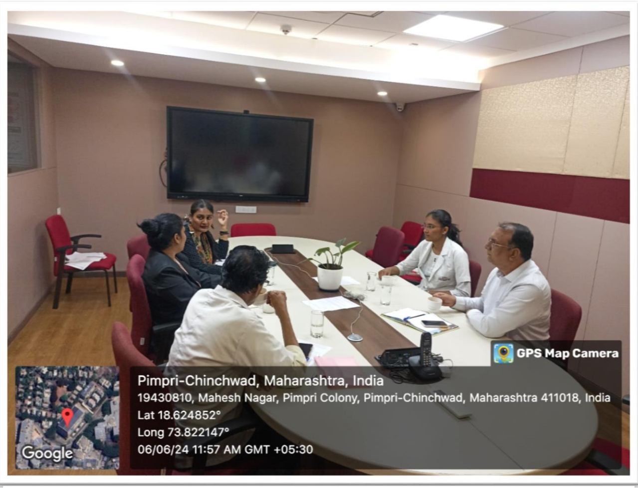
Meeting of Internal Committee for the Students with Disabilities was conducted on 6th June 2024